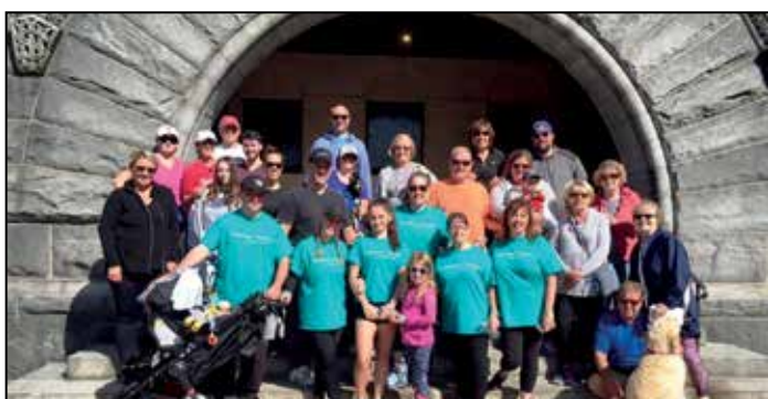
The Boston Team.