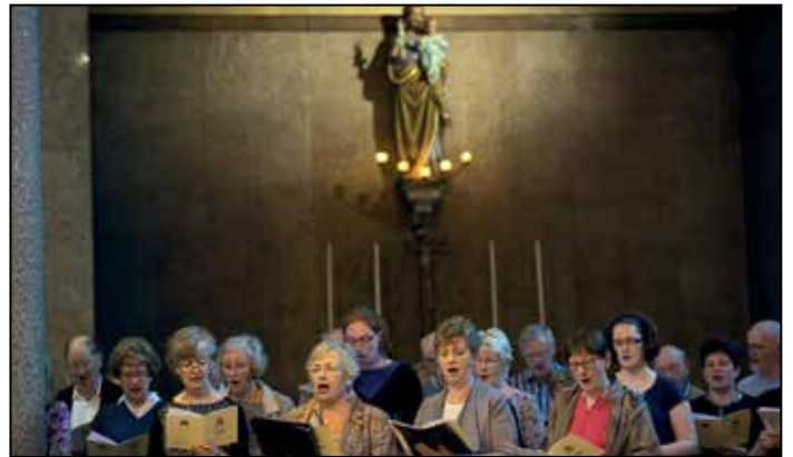
The Culwick Choral Society