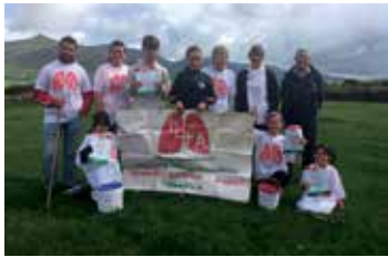
Members of Feile Lois Poil on the fundraising walk.