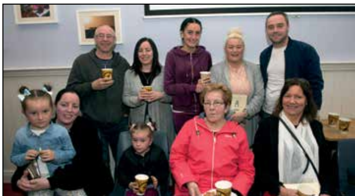
The Killeen Family