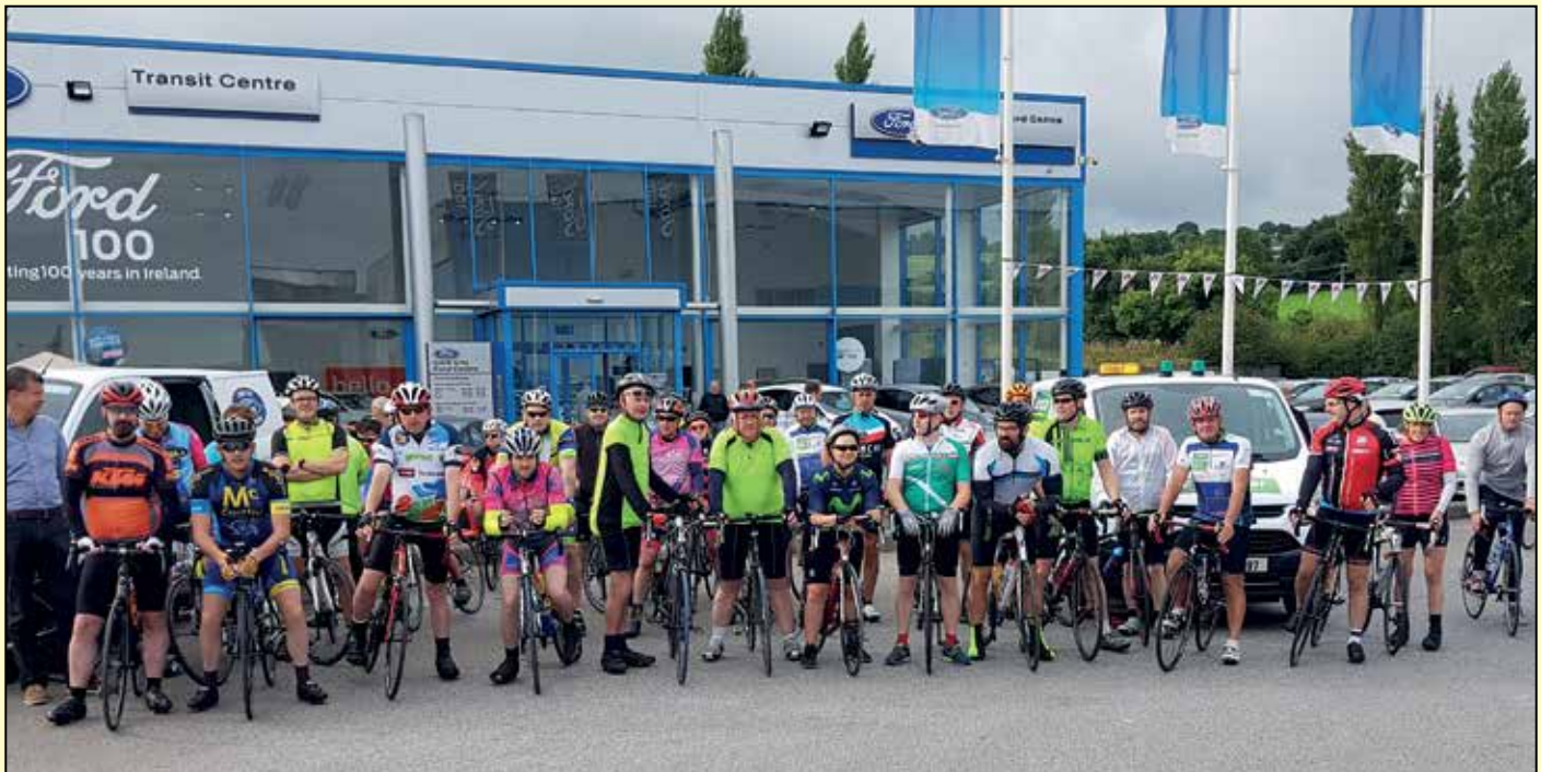
Cyclists at the start of the Pat Casey Memorial Cycle.

On Saturday 2nd September 2017, over 40 cyclists and support crew set out on the 122km round trip starting from the Cork City Ford Centre on Forge Hill, through Innishannon, Bandon, Clonakilty, Timoleague, Kinsale and finally returning to the Ford Centre again.