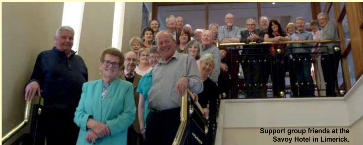
Support group friends at the Savoy Hotel in Limerick.